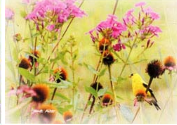
STEM's "Nature in Moorestown" Photo Contest Winners for 2015