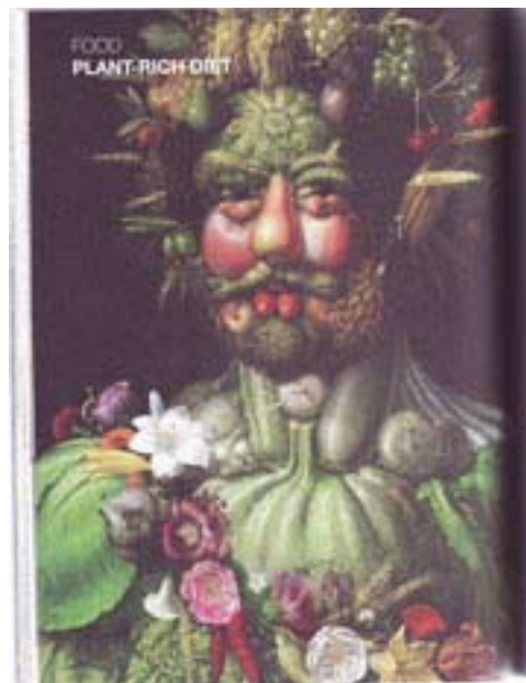
Image above, is “Vertumnus” by the painter Guiseppe Arcimboldo, created in 1590-91. It appears on page 38 of “Drawdown,” used to symbolize a plant-rich diet—one of the book’s solution descriptions.