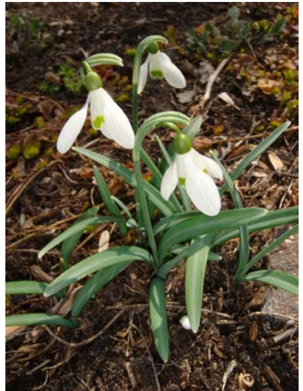
Photo above, captures a colorful early bloomer, the snow bell.