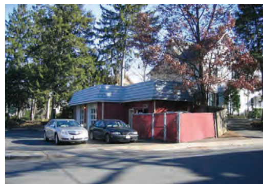
Photo above, taken on January 9, 2008, is of the former Ward's Service Station (now demolished) on the corner of Main and High Streets in Moorestown. The property is the future site of Percheron Park. Image on far left is a woodcut of Diligence, Harris' Percheron horse.