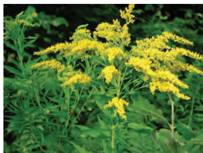
Photos: Above, Rough-stemmed goldenrod (Solidago rugosa), Right, Hardy ageratum (Eupatorium coelestinum), Far right, Scarlet Bee Balm (Monarda didyma)