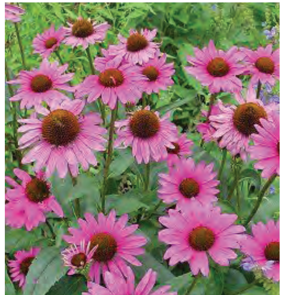
Photo: Purple Coneflowers (Echinacea purpurea) courtesy of North Creek Nursery

The Plant Sale is STEM's only fundraising event of the year. To donate plants for the sale, please contact Nanci Clem at 856-866-0065 or nclem91397@comcast.net . All proceeds from the Plant Sale go toward the STEM mission.