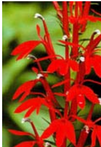
Photos above: top, Purple Coneflower ( Echinacea purpurea ) and bottom, Cardinal flower ( Lobelia cardinalis ) are native plants that attract a variety of pollinators.