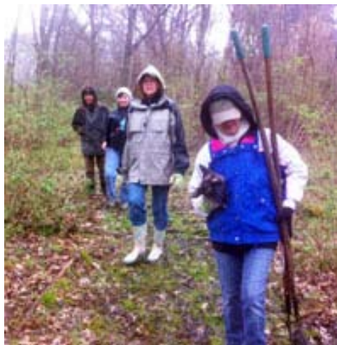
Photos from the Wigmore Acres Project, Saturday, April 9, 2016