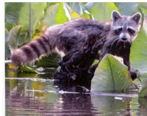
Photo below by Bill Creekmore, 2nd Place Adult 2015, "Masked Hunter."

Detention and sediment settling ponds were installed during the same period as bank erosion controls. The three sediment settling ponds on the Route 38 side of the Upper Lake were designed to take sheet flow from Route 38 and remove the sediment before the water entered the lake. One of the three is now full of sediment, and trees have grown up around all of them, making maintenance difficult. On the Haines Drive side, all ponds need maintenance and a lot of love and care.