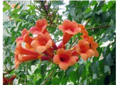
While adding color to your gardens, planting natives creates a food source for visiting wildlife—adding another reason to enjoy the outdoors. From left, black-eyed Susan ( Rudbeckia hirta ) and trumpet vine ( Campsis radicans ). When buying natives, ask for them by their binomial name to ensure you are purchasing a true native—the best for our animal friends.