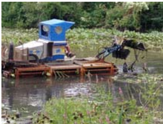
Above, mechanical removal of overgrown Spatterdock from Strawbridge Lake.