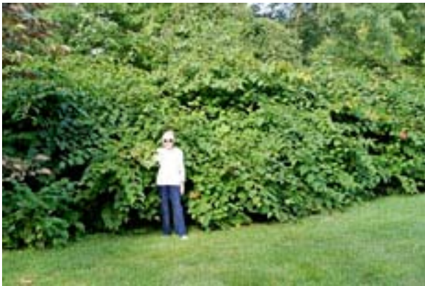
Photo above by Chet Dawson shows Barb Rich dwarfed by masses of invasive Japanese knotweed at Strawbridge Lake.